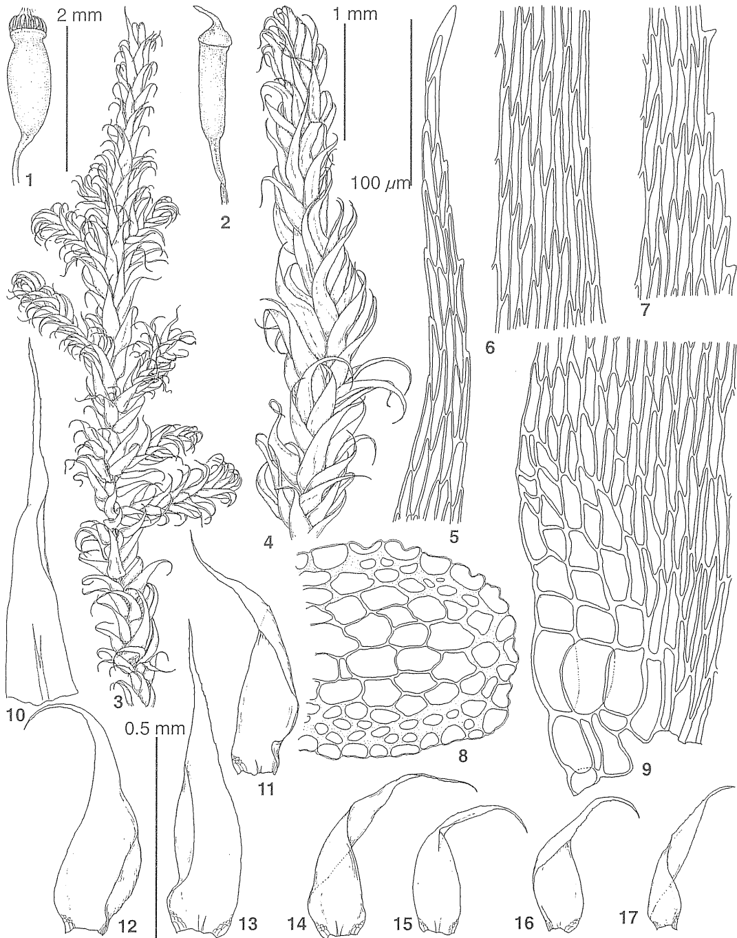
Fig. 1. Pylaisiadelpha tenuirostris (Bruch & Schimp. ex Sull.) W.R.Buck (from Ussurijsky Reserve, Ignatov & Ignatova #06-2965, MHA): 1-2 – capsules; 3-4 – habit; 5 – upper leaf cells; 6-7 – mid-leaf cells; 8 – stem transverse section; 9 – basal leaf cells; 10 – perichaetial leaf; 11-13 – stem leaves; 14-17 – branch leaves. Scale bars: 2 mm for 1-3; 1 mm for 4; 0.5 mm for 10-17; 100 μm for 5-9.

Plants small, in soft, green, or more commonly yellow to brownish, slightly glossy mats. Stems 0.5-1.0 cm long, subpinately branching; branches